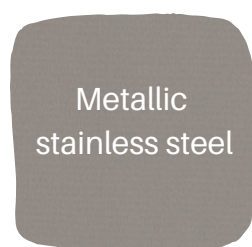
Metallic stainless steel