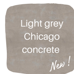
Light grey Chicago concrete