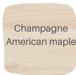
Champagne American maple