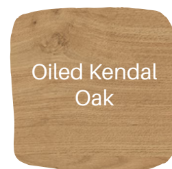
Oiled Kendal Oak