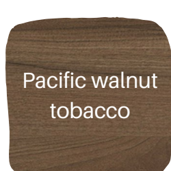
Pacific walnut tobacco