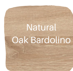
Natural Oak Bardolino