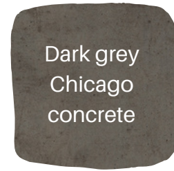
Dark grey Chicago concrete