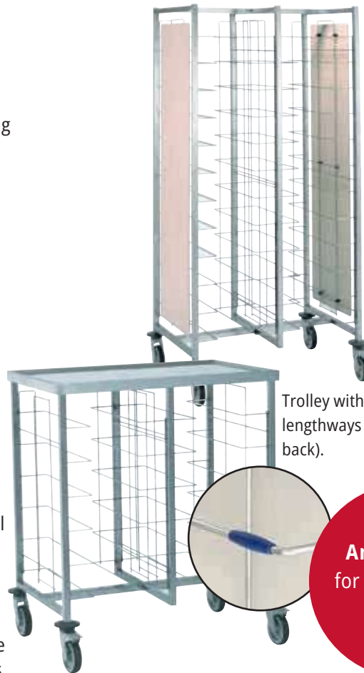
Trolley with 2x12 levels, insertion widthways with two stacks (side by side), with side panels.

Trolleys with side panels: the laminated panels fixed with clips are easy to remove for thorough cleaning. The panels can also be installed on trolleys that did not have any originally