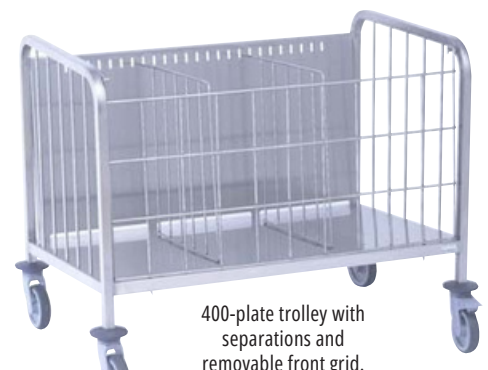
400-plate trolley with separations and removable front grid.

The trolleys (200 and 300 plates) can be delivered in flat packs to keep transport and storage costs down.