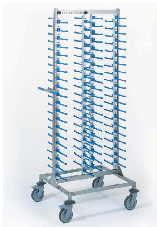
Plated food trolley

Each plate is held firmly as if by an experienced hand. The plates are supported at 4 points and held from above and below, ensuring a perfectly horizontal position. The non-slip coating on the pins and the patented clip system guarantees that plates can be transported in total safety.