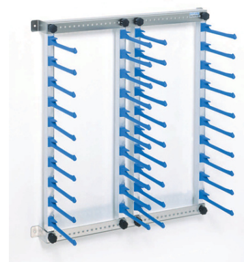
Wall plate stacking trolleys