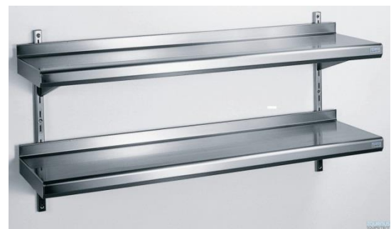
WIDTH 290 MM